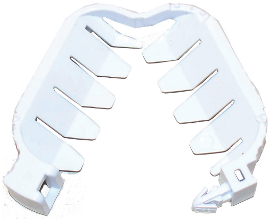
Weasand Clip for Beef - White 1012265- 2000 in Box - Bulk 1012261- 2000 in Box - Joined