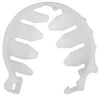
Weasand Clip for Sheep 1012135 - White - 6000 in Box - Bulk 1012173 - Blue - 6000 in Box - Bulk

Jarvis Weasand Clips - for sealing the esophagus of slaughtered stock.