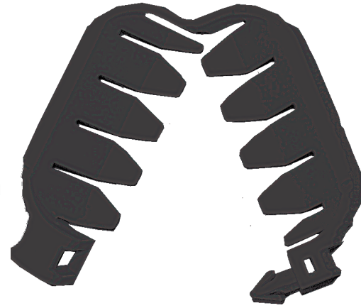
Weasand Clip for Beef - Black 1012264 - 2000 in Box - Bulk 1012260 - 2000 in Box - Joined