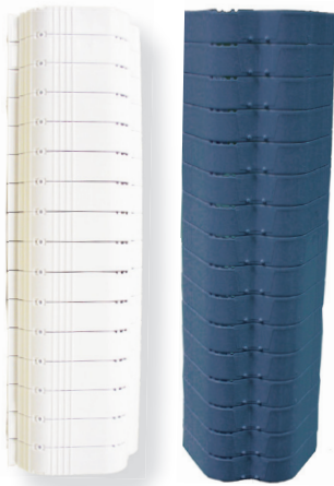
Joined Weasand Clips (rows of 25)